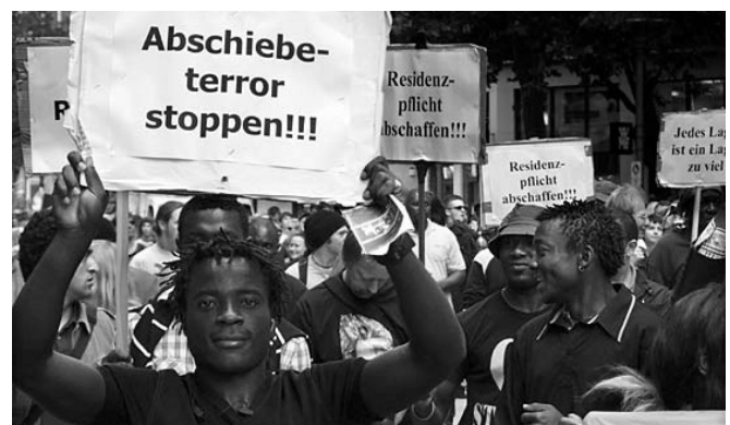
demonstration in Hamburg on the 16th of August 2008

Refugee and migration-related struggles in Germany have never been mass mobilisations. Nonetheless, everyday somewhere in Germany there is resistance against deportations, or refugees protest against the dehumanising conditions in camps. A wide spectrum of antiracist networks is active on various levels, in part for more than 10 years now (for example No One Is Illegal groups or the Caravan for the Rights of Refugees and Migrants). "Manifold but divided" could be an adequate characterisation. Given that the migration-related movement has not really been able to bundle its potential and come together at least in specific campaigns and mobilisations, it has failed to create a broader dynamic within society. However, in the last few years, a few groups have made first attempts to link migration issues to labour issues and to connect the struggle against illegalisation and deportations with other political social conflicts. This strategy succeeded last year during the anti-G8-week in Rostock, when 10.000 people joined our demonstration "For Freedom of Movement and Equal Rights" on June 4th. Another initiative, the "Initiative for Global Social Rights", brings together left-wing union activists and a variety of NGOs and follows the same intention - namely to create more cross-over debates and projects, where freedom of movement is one of the fundamental demands.