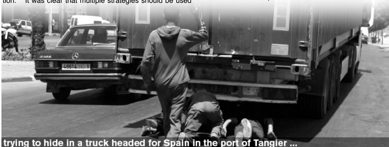
trying to hide in a truck headed for Spain in the port of Tangier ...

Cross-sectional alliance building is a key part of amplifying the struggle. Bridge-building between African American civil rights groups, as well as with the traditional left in the U.S. at a broad scale is still tenuous. In order to develop deeper alliances with these and other important sectors, we have to re-frame the issue of immigration to go beyond legalization. In the battle of ideas, the racist, anti-immigrant have prevailed, framing the current debate as a simple case of law and order. Several different national networks and coalitions are currently struggling to create a space to dialog about these issues around a broader social justice framework that speaks to the needs of all communities. The challenge has been trying to balance these long-term conversation with the urgency the raids which continue to separate families.