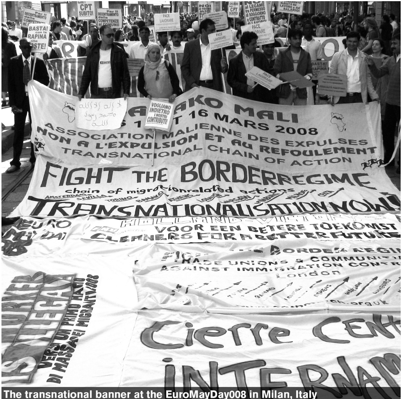
The transnational banner at the EuroMayDay08 in Milan, Italy

More information on the ESF at: www.esf2008.org