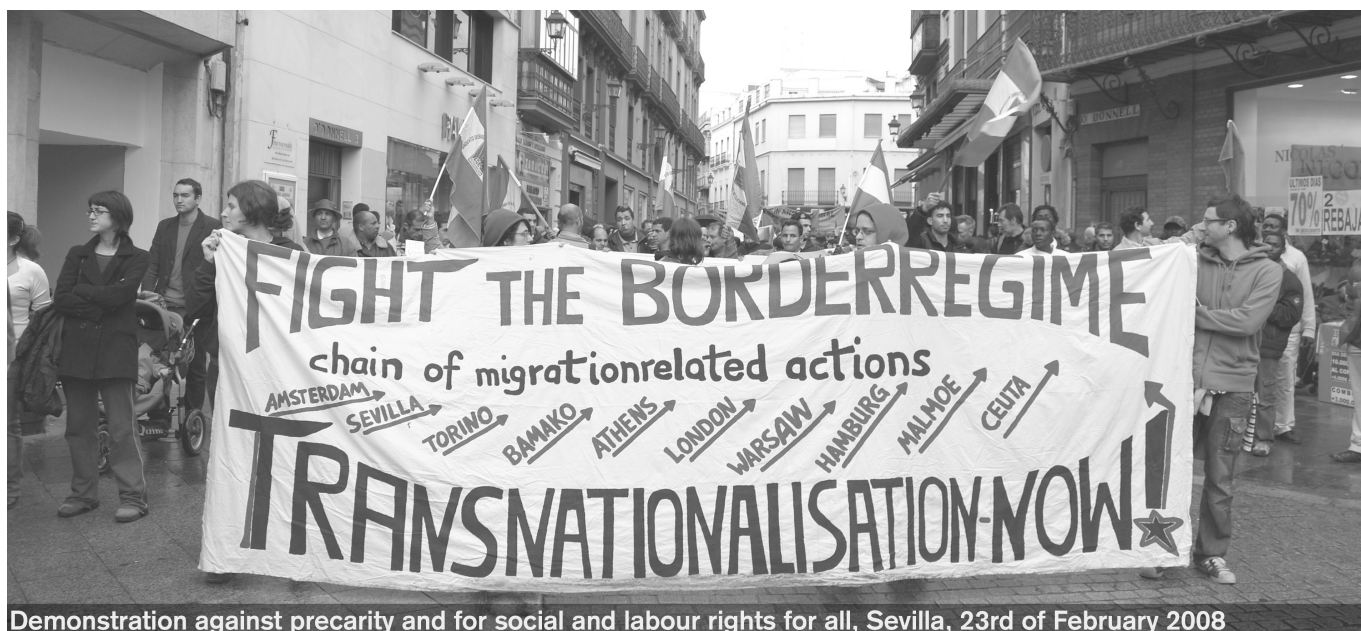
Demonstration against precarity and for social and labour rights for all, Sevilla, 23rd of February 2008